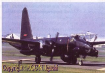
NP-2H, shown here, "was" an SP-2H Neptune.

(DLIR) systems. The port circular nose fairing housed the Low Light Level Television (L3TV) system and the starboard circular nose fairing contained the APN-153 Terrain Following Radar (TFR) system.