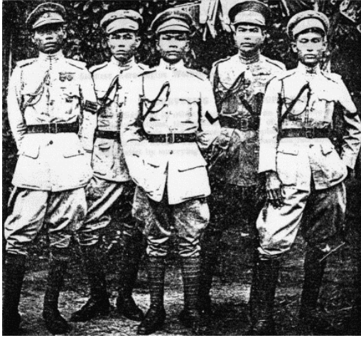
Siamese N.C.O. Pilots.