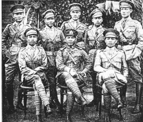
Siamese Officer Aviators.