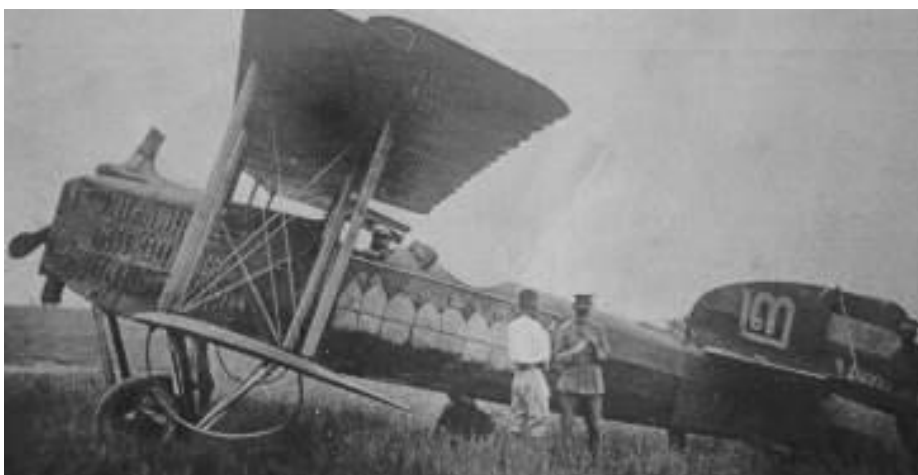
A Siamese Postal Aeroplane.

Owing to the results of these experiments, it was agreed between the Royal Aeronautical Service and the Post and Telegraph Department, that mails should be carried by aeroplanes between Korat, Roy Et and Ubon (East), a total distance of about 400 kilometres. At present, there is a mail service to and from these places once a week. Formerly this mail service took a fortnight. In the near future this route will be extended to Ubon and other towns.