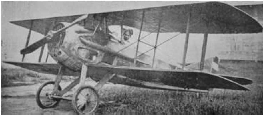
A Siamese Spad Military Machine.