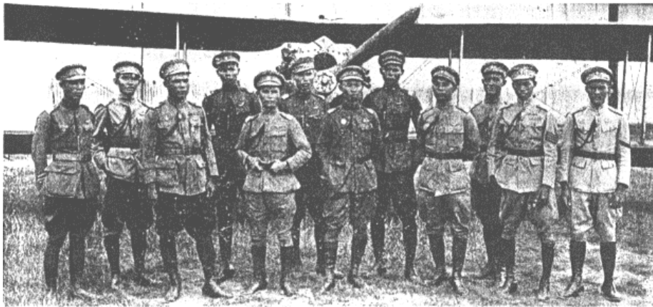
A Group of N.C.O. Pilots of the Siamese Army Air Service.

The Royal Aeronautical Service employs Nieuport "Baby" 13, 15, 18, 23 square metres and Spad XIII for training purposes, Nieuport-Delage 29C.1 for scouting and fighting purposes, and the Breguet 14A.2 for two-seater reconnaissance and photographic work. The Breguet XIV T four-seater commercial machine is used for passenger-carrying purposes, the Breguet XIV type "Sanitaire" for ambulance work, and the standard Breguet XIV, with additional mail bag compartments fitted under the bottom planes, for postal work.