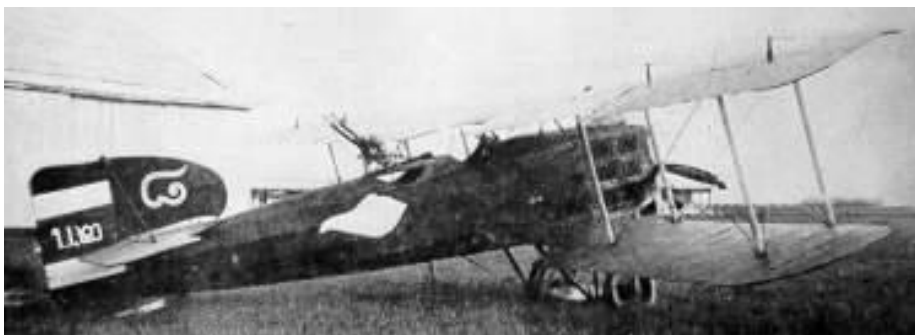
A Breguet XIV Biplane of the Siamese Army Air Service.

The machine is a Nieuport-Delage 29-C.1 (300 h.p. Hispano-Suiza engine)