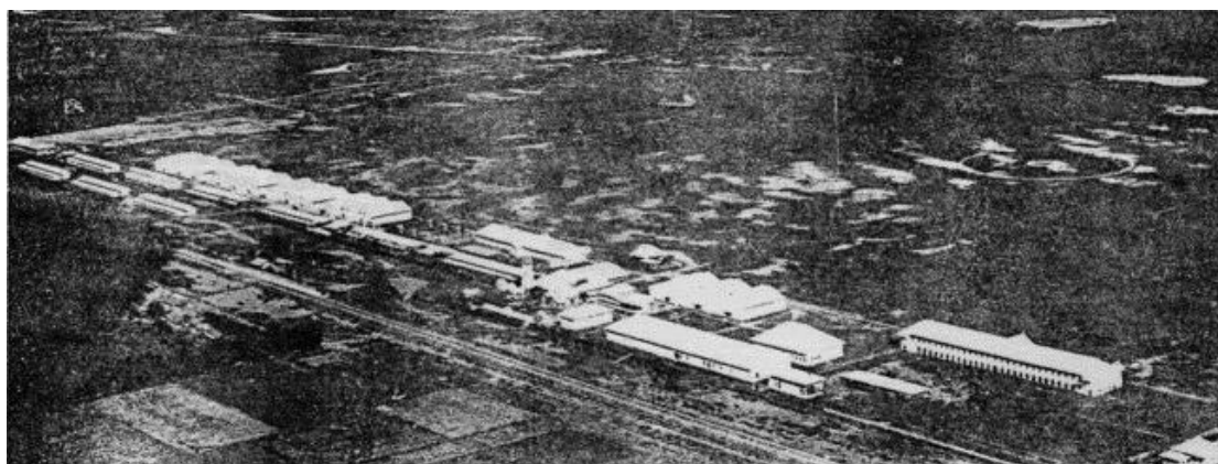
The International Aerodrome at Don Muang, 20 kilometres from Bangkok.